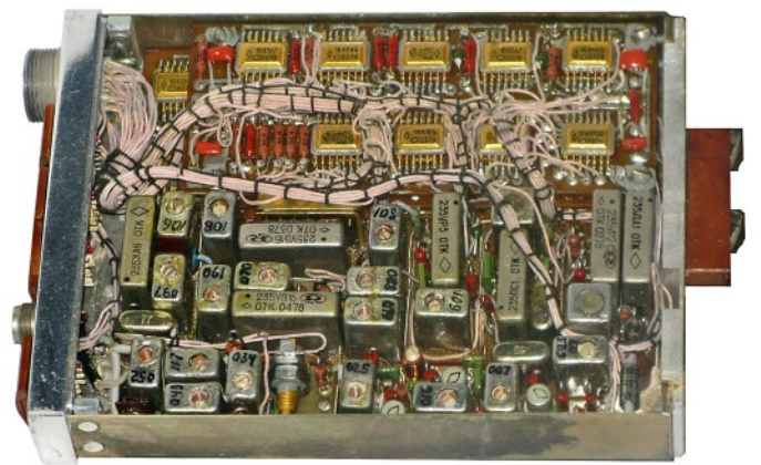
Internal view of Orange-2. Note two rows of digital IC's.

Bottom view of Orange-2 showing battery contacts, battery and battery retaining clip.